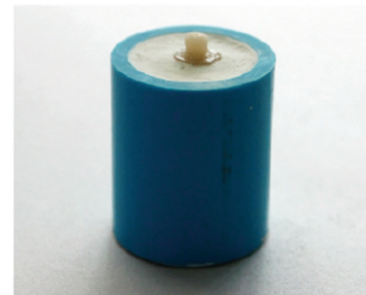
Figure 4: Top view of specimens after repair with resin composite height 3 mm.