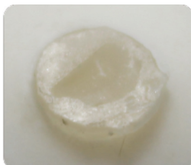
Figure 7: Top view of specimen cohesive failure shows crack depth within resin composite.