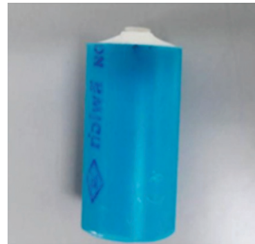
Figure 1: Side view of a specimen showing 1 mm of the top surface with emerging resin composite.

(compositions shown in Table 1) and slightly blown for 5 sec. The specimen was exposed to curing light for 20 sec. Split molds of cylindrical specimens were placed on the semicircle (exterior diameter 22 mm, interior diameter 3 mm, and height 3 mm (Figure 3). The specimens after