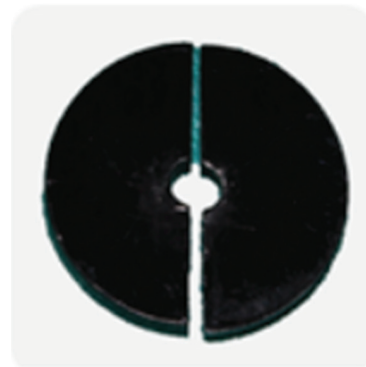
Figure 3: Acrylic split mold show interior diameter 3 mm and height 3 mm.

Shear Bond Strength Testing: All six groups repaired with resin composite were mounted on a universal testing machine (Universal Testing Machine. LLOYD model LR 30 K. Lloyd Instruments Ltd., Hants, England) by setting the test speed at 0.5 mm/sec and the tip of the wedge at the interface between the old and repaired resin composite (Figure 6). We recorded the moment (shear bond strength in MPa) when adhesive strength failed (7,13,14) . The tested