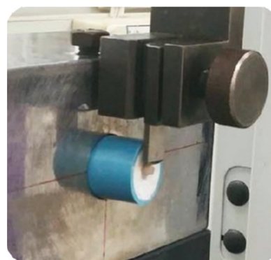
Figure 6: Side view of specimen on the Universal Testing Machine. The tip of the wedge is set at the interface between the old and repaired resin composite.

The respective shear bond strength of X-tra fill® of the six groups after repairing with resin composite, sorted from the highest to lowest median values, for group 4, 2, 3, 1, 5, and 6 are 25.8, 25.5, 22.1, 21.8, 14.0, and 13.2 MPa (Table 2). The statistical analyses on shear bond strength by method of surface treatment and type of repair material using Friedman's analysis revealed significant differences