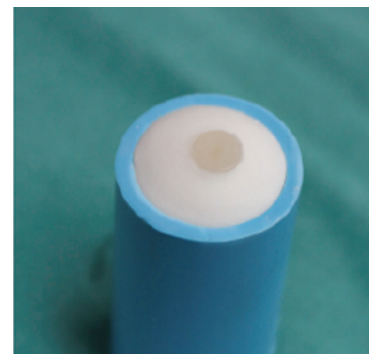
Figure 2: Top view of cylindrical specimens fabricated with acrylic resin at the center of PVC tube.