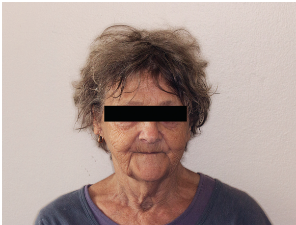
Figure 1: On the first dental visit the patient was moody and frustrated. Her appearance and clothes were neglected.

At the first dental visit, the patient came to the ICOH dental clinic with a young nurse assistant who was not fluent in English. The patient appeared moody and frustrated about visiting the clinic. Her appearance and clothes were neglected. (Figure 1) We performed an oral examination and observed the patient's behavior and communication skills. Because her main caregiver did not accompany her, the patient's history was taken by interviewing the caregiver by phone call on the first visit. Based on the patient's comprehension and behavior, we requested the main caregiver to come with the patient for the subsequent dental visits.