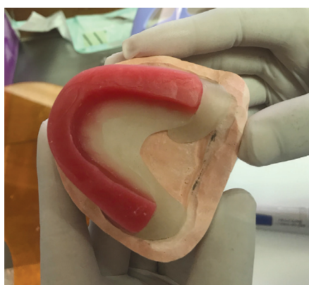
Figure 3: We shortened the posterior border of the upper arch occlusal rim for the try in.

marked. Subsequently, wax bite registration material was used for recording the jaw relation. The patient was asked to watch and follow the dentist. The vertical dimension was determined until it reached the appropriate height. The denture teeth were arranged using non-anatomic teeth to reduce lateral interference. The esthetic try-in and jaw relation verification was done using a trial denture. Due to the midline shift, the jaw relation record was re-verified with vinylpolysiloxane bite registration (Blu-moose ® , parkell ® , Edgewood, NY, USA) to consume lesser time. The upper denture palate portion was waxed up to regain full palate coverage. Both dentures were fabricated using high impact resin. Although the upper denture was slightly loose, the lower denture had good retention and stability. The tissue surface and denture border were evaluated with pressure-indicating paste (Keystone, Gibbstown, NJ, USA). Occlusal correction was performed intraorally to eliminate occlusal interferences.