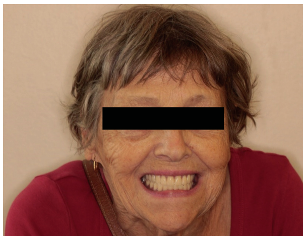
Figure 4: The patient at the 1-month recall.

The caregiver was the key person who supported the patient to wear the denture. One month after denture delivery, the patient refused to wear the dentures all the time except at mealtimes. Due to the worsening of her AD symptoms, she required a private nurse 8 h. a day. The denture together with encouragement from the caregiver improve the quantity and quality of the meals and she gained 4 kg after 3 months. Her appearance and mood also greatly improved. (Figure 4)