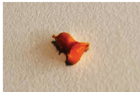
Figure 3: An example impression model of sample no. 1’s defect.